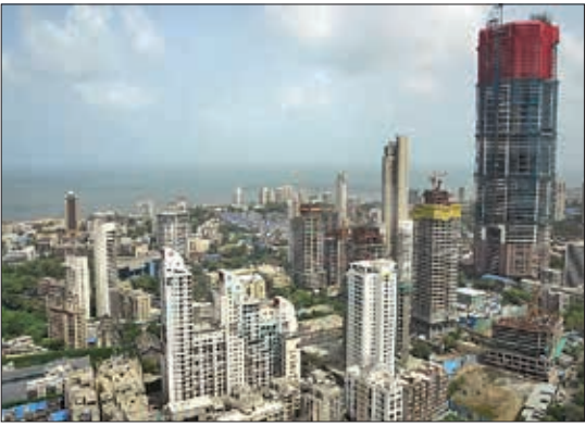
Suburban Mumbai accounts for maximum number of projects (109) under scanner.

Similarly, there are situations where the targeted date of com-