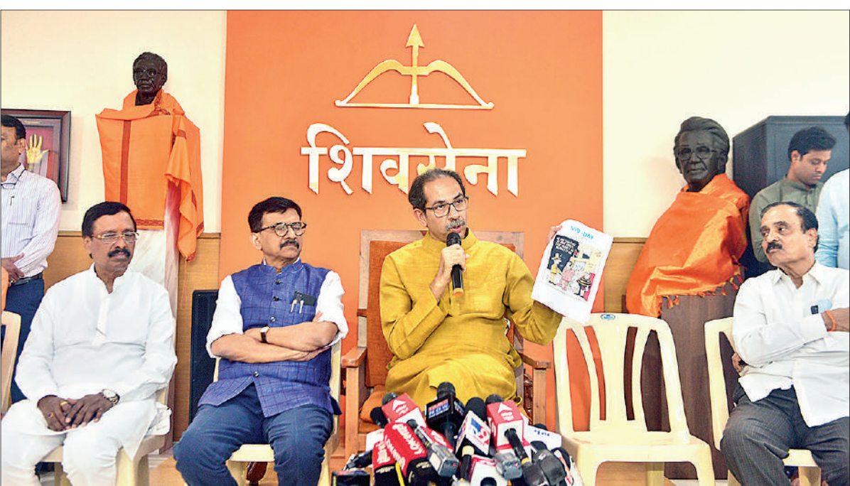
Shiv Sena -UBT chief Uddhav Thackeray addresses a press conference at Shiv Sena Bhavan in Mumbai on Monday. He is flanked by Sanjay Raut (on his right) and other party leaders.

In a big blow to Uddhav Thackeray, the Election Commission on Friday allotted the name Shiv Sena and its