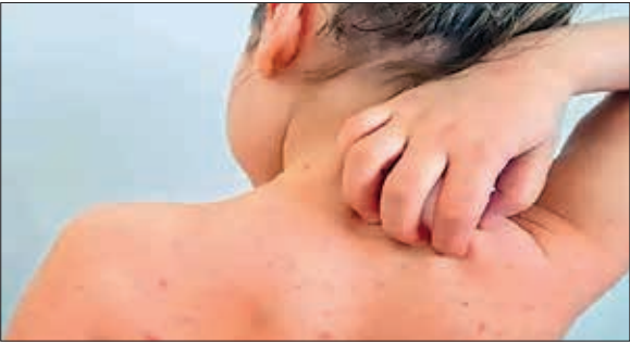
Measles is a highly contagious disease caused by a virus in the paramyxovirus family.

As per official data, outbreak response immunization (ORI) undertaken by the civic body began on December 01, 2022. Since then, out of 2.32 lakh kids in the age group of 9 months to 5 years, over 1.98 lakh (85.29%) have been administered an