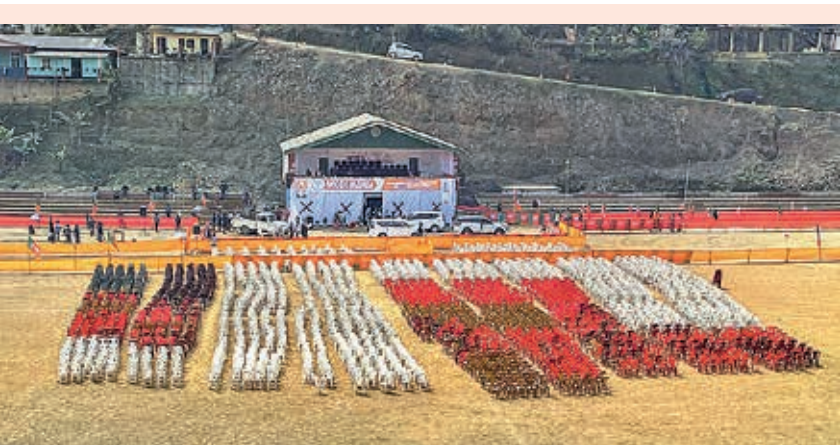
Preparations underway for Amit Shah’s rally for the upcoming Nagaland elections on Monday.

The organisers claimed that Shah’s visit is the first by any Union Home minister to this district in the eastern tip of Nagaland, which also shared boundary with Myanmar.