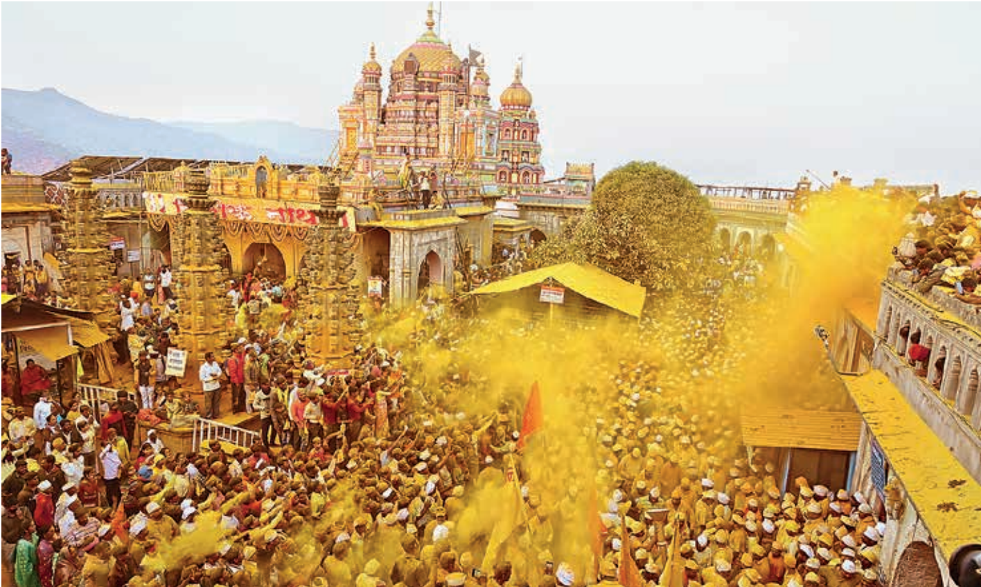
Devotees throng Khandoba Temple in Jejuri, near Pune district of Maharashtra on the occasion of Somvati Amavasya. According to rough estimates, over two lakh devotees offered prayers at the temple on Somvati Amavasya that occurred after nearly three years.

On specific information, teams of the BSF and Punjab Police launched a search operation in the area of New Hasta Kalan village, and recovered the Quadcopter drone (DJI Matrice 300 RTK), made in China, from an open area on the outskirts of the village. The BSF in coordination with Punjab Police once again was able to capture a rogue drone, it added. Punjab shares a 553-km long international border, with a barbed wire fence, with Pakistan.