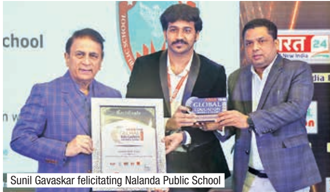
Sunil Gavaskar felicitating Nalanda Public School