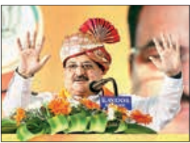
Nadda at an event in Udupi.

Ahead of the Karnataka Assembly elections, BJP president JP Nadda is on a three-day visit to Karnataka. According to BJP, Nadda