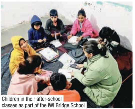
Children in their after-school classes as part of the IWI Bridge School