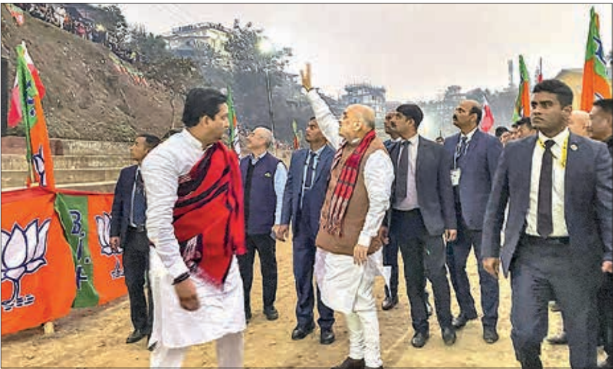
Amit Shah waves at supporters during a public rally, in Nagaland’s Mon, on Monday.

Amit Shah neither made reference to the objectionable word nor named the Congress leader, but BJP leaders said it was in relation to Congress spokesperson Pawan Kherra recently referring to the prime minister as “Narendra Gautamdas Modi”.