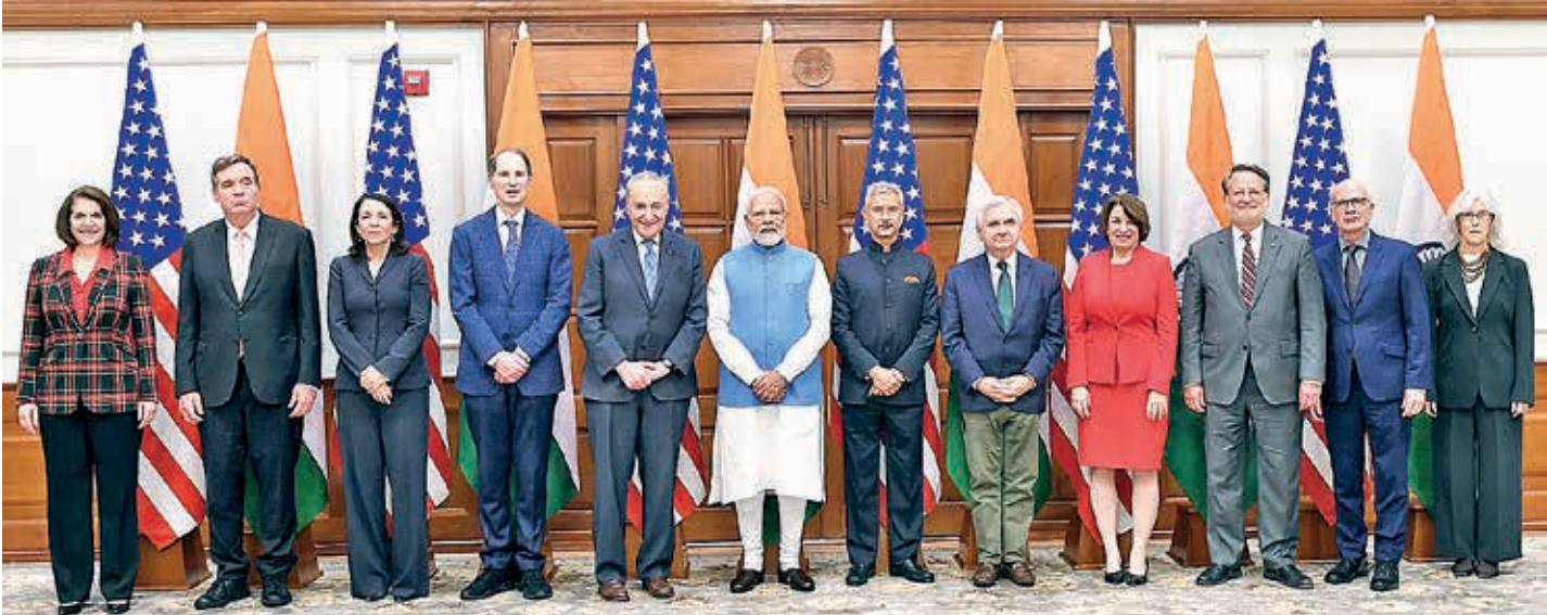
PM Narendra Modi and EAM S Jaishankar with Senate Majority Leader Chuck Schumer in a group picture with US Congressional delegation, on Monday.