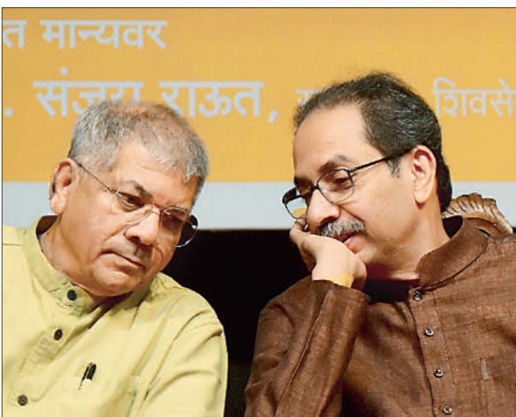
Vanchit Bahujaan Aghadi chief Prakash Amedkar with Uddhav Thackeray.

VBA chief Ambedkar reinforces tie-up, expresses hope for MVA constituents NCP, Congress to join