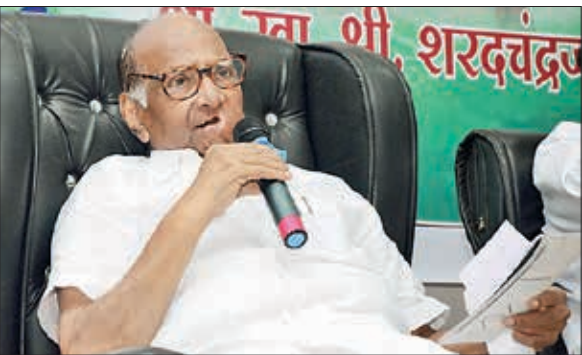
NCP President Sharad Pawar.

The entire sequence of events indicates that Sharad Pawar was not aware of this. If Sharad Pawar had to play this game, he would have