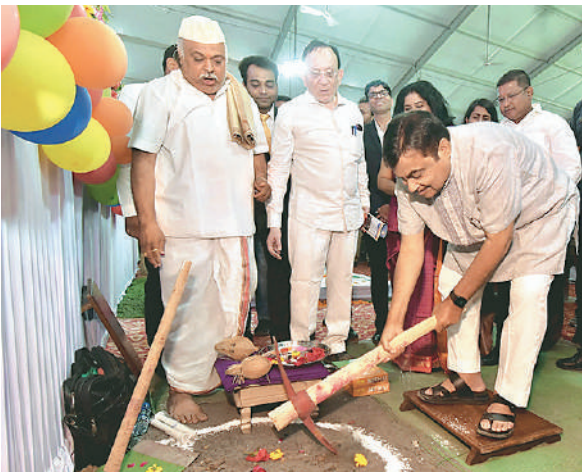
Nitin Gadkari lays the foundation stone of 'Divyang Anubhuti Inclusive Park' in Nagpur on Monday.

The Union minister, who has conceptualized the facility, said the park is being constructed keeping the three lakh 'divyangs' in Nagpur and also over five lakh senior citizens.