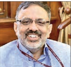
Cabinet Secretary Rajiv Gauba

The mission, billed as one of largest capacity-building initiatives in govt organisations anywhere in the world, seeks to keep the civil service at the centre of all change, empowering it to deliver in challenging environments, officials said, adding that Mission Karmayogi adopts a citizen-centric approach for civil service reforms.