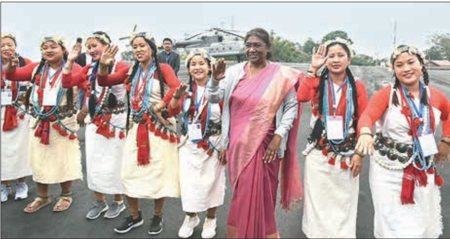
President Droupadi Murmu with the traditional dance troupes on her first visit, in Itanagar on Monday.

Meanwhile, President Murmu arrived in Itanagar on Monday af-