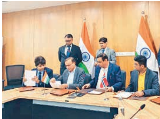
NPCL and Norway officials during the signing of MoU.

Greater Noida: Noida Power Company Limited (NPCL) has signed a consortium agreement for carrying out a pilot project on Demand Response in Greater Noida under the India-Norway Energy Taskforce.